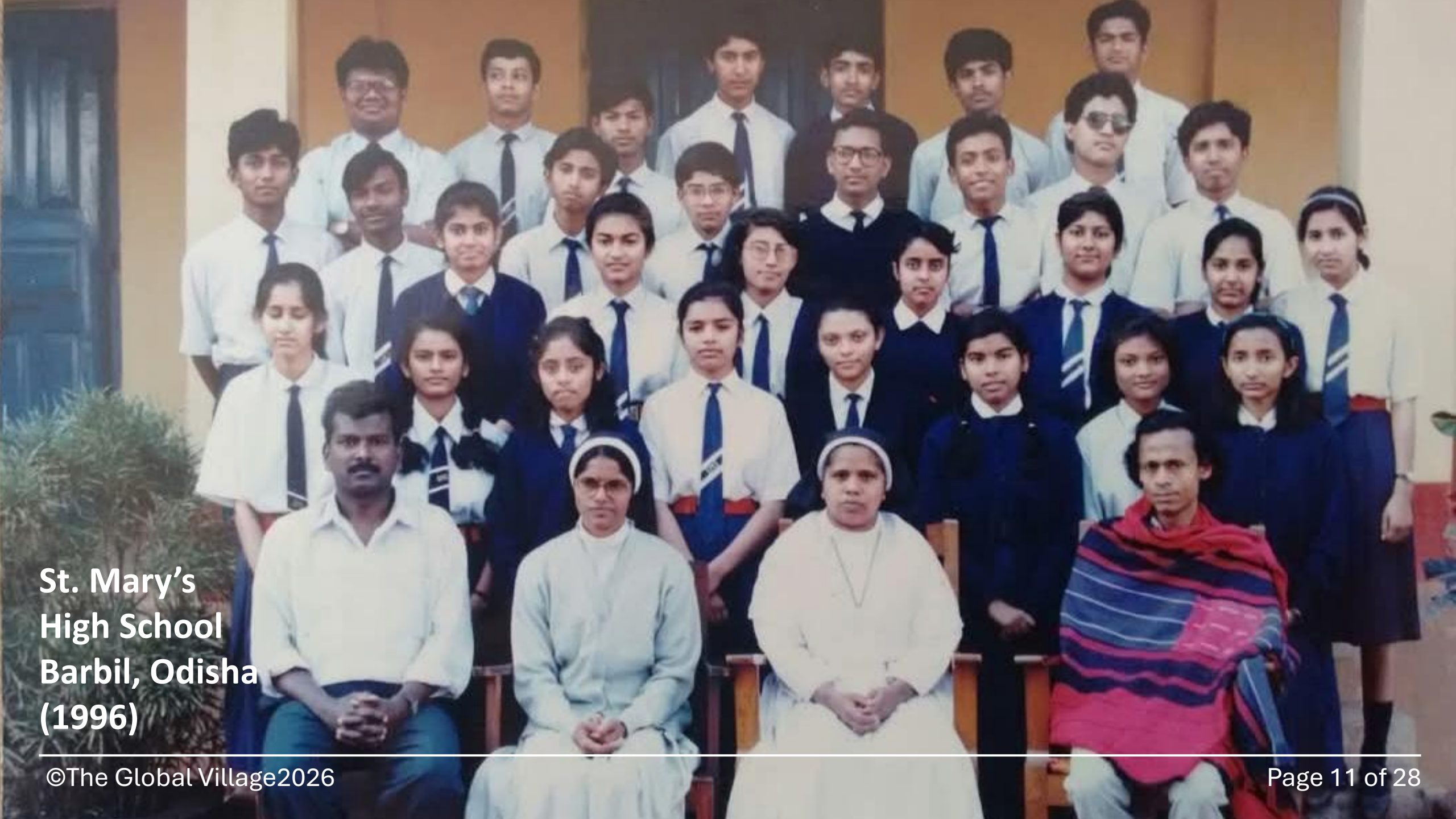
St. Mary's High School Barbil, Odisha (1996)