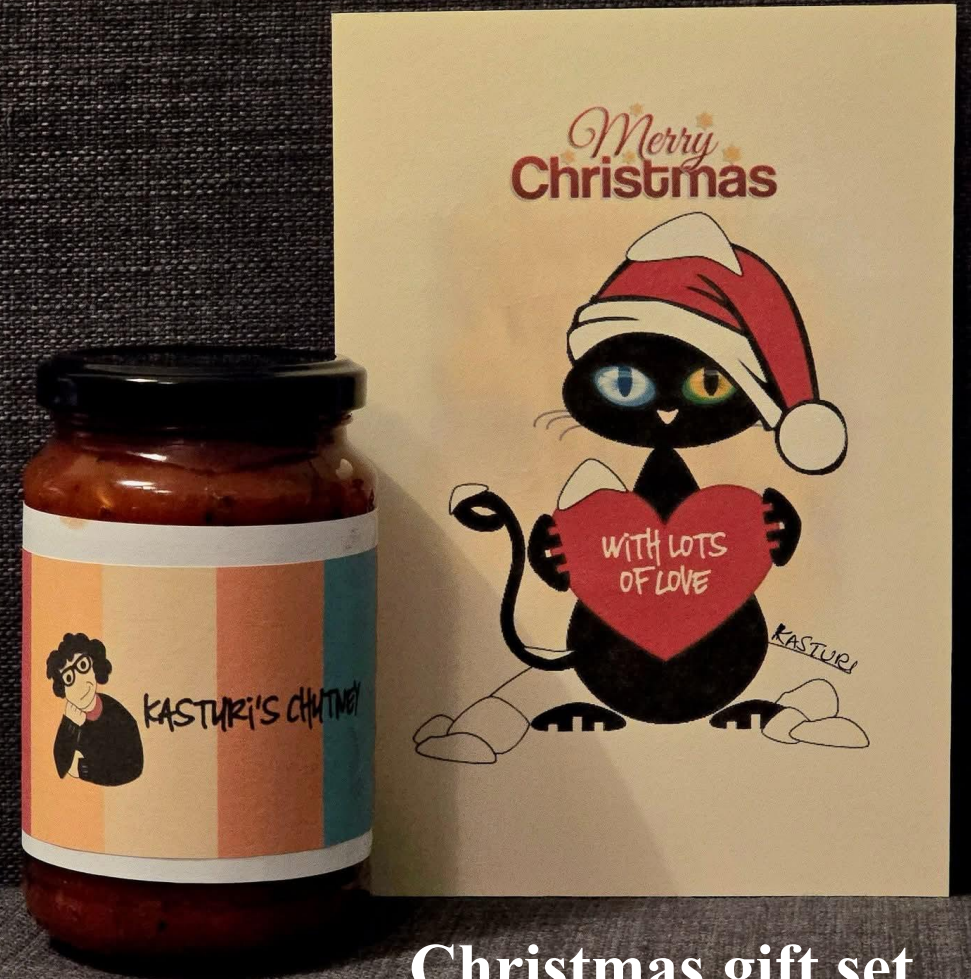
Christmas gift set Dundee (2025)

End-to-end inhouse production and distribution still forms one of the six lines of businesses that make up The Global Village Ecosystem.