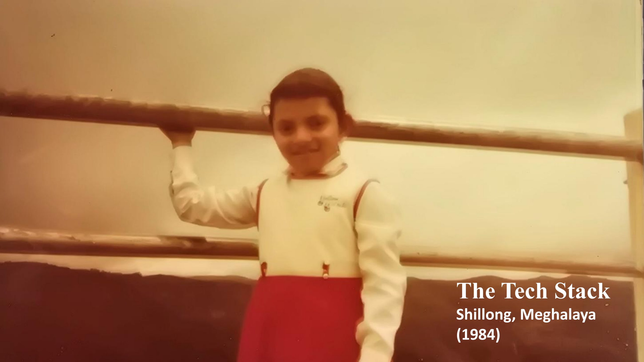
The Tech Stack Shillong, Meghalaya (1984)